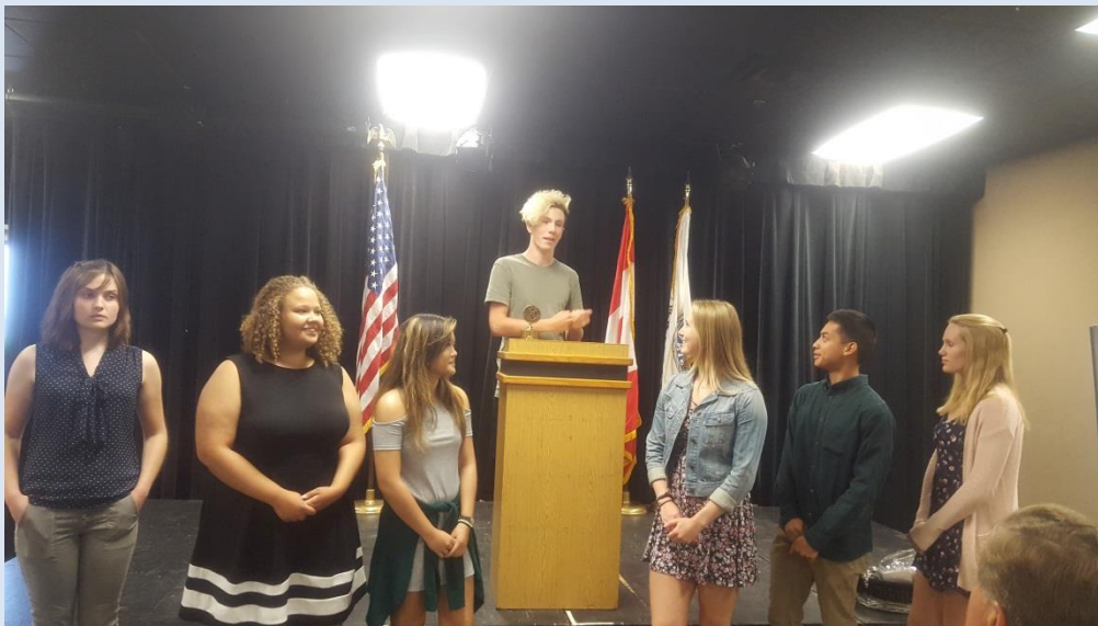
Congratulations to Kiwanis-Bennett Memorial Scholarship Recipients!