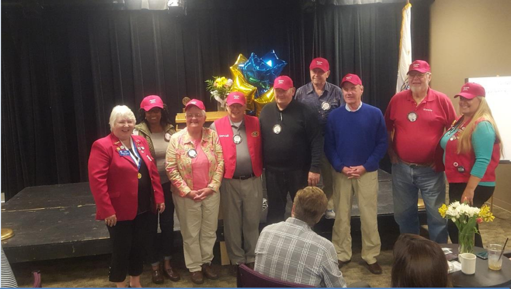
Installation – September 2016