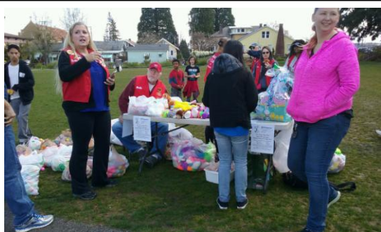
Easter Bunny Buddies before the hunt as the volunteers begin hiding the eggs.

The biggest of 3 table groups busy stuffing eggs.