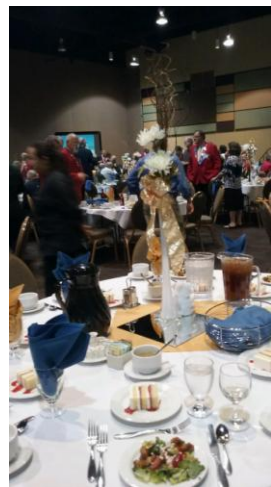
Beautifully decorated tables at the Governor's Banquet