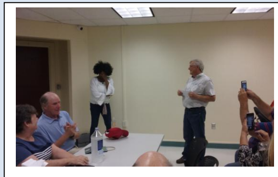
Pam accepting the club grant to the library for the third grade reading program.