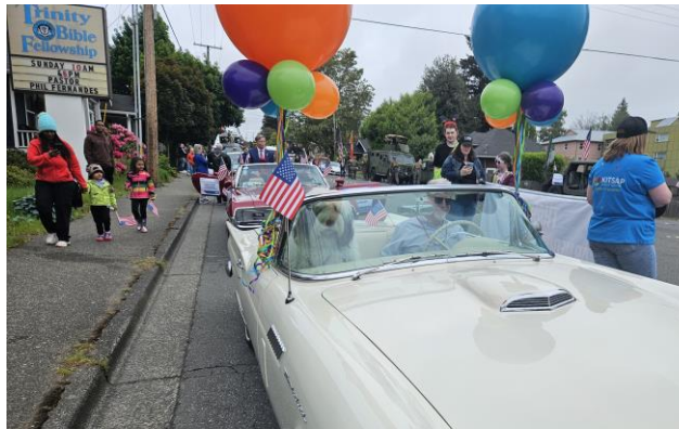
Left – Kitsap Credit Union's A13 car with a very popular furry friend enjoying the children and balloons.